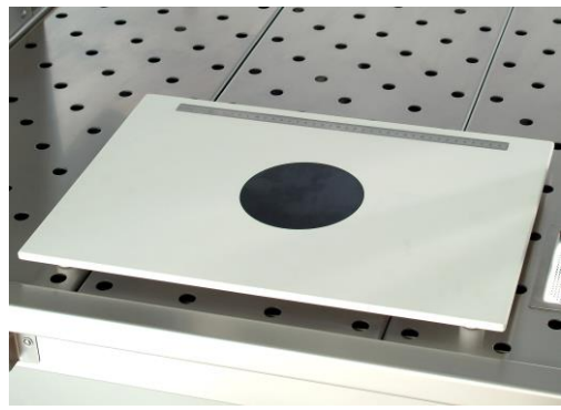
Cutting board made of Corian with a round black point SB-C0-50/40-SE