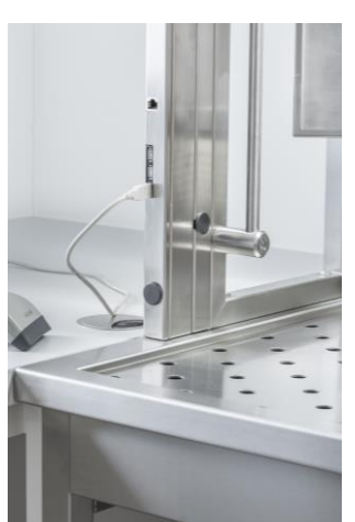
Cable channel installed around the entire illumination of a grossing table. USB and LAN ports separately available upon request.

Width cable channel 1,500 mm KK-BEA-1500 – Art. No. 060.018.120 Width cable channel 1,750 mm KK-BEA-1750 – Art. No. 060.018.122 Width cable channel 2,000 mm KK-BEA-2000 – Art. No. 060.018.124