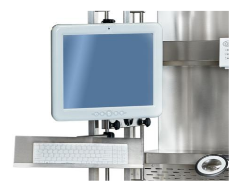
Camera holder mounted to the railing system with monitor and keyboard holder laterally mounted to the side rails suitable for the PathLite Compact camera system consisting of camera for glare-free gross imaging and suitable computer and monitor with preinstalled VividPath software.