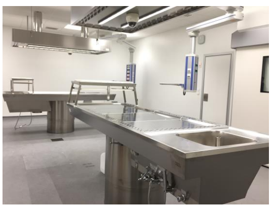
Fresh air hood with LED recessed luminaires and video camera (customized solution)

This fresh air hood was particularly designed for the area above the autopsy table. It has a sturdy self-supporting construction and is made of brushed stainless steel (material no. 1.4301 – ANSI 304). The fresh air hood comprises 4 mountings points to mount it to the ceiling by means of threaded bars or steel ropes. Adjustable air fins guarantee even and drought-free airflow and hence prevent the raise of harmful vapors. Glare-free LED recessed luminaires guarantee for very uniform illumination of the illumination area (half-peak divergence: 2x44°) The fresh air hood is to be connected to a ventilation system provided by the customer.