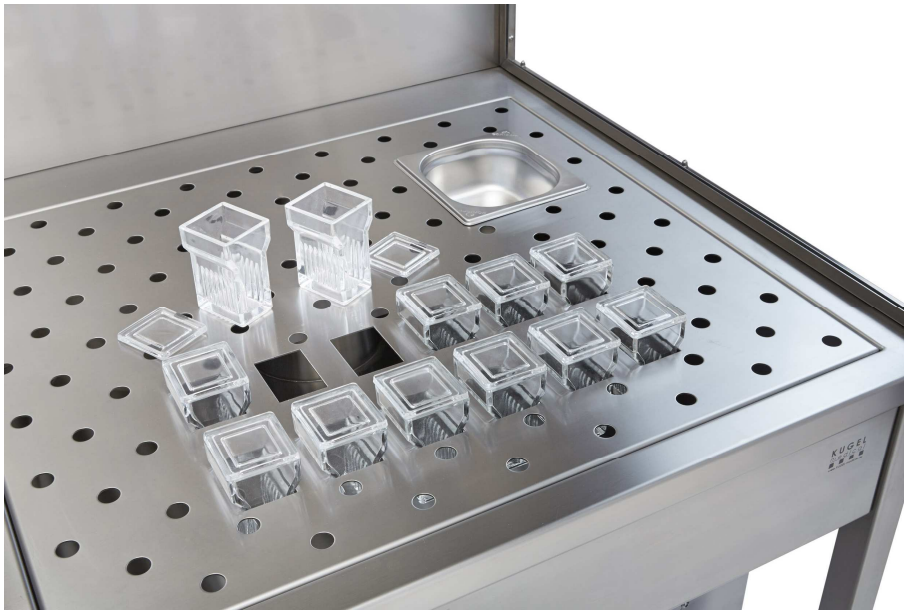
Perforated working area with openings for glass cuvettes (optional without openings)